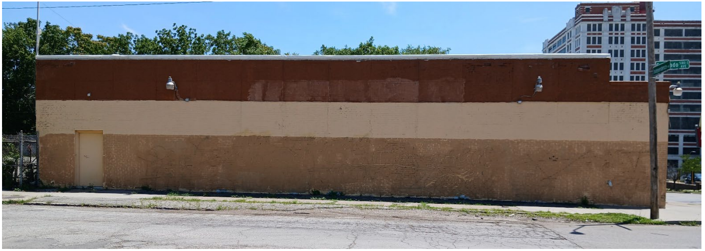
West Facing Colorado Ave. wall of the Bargain Market. Approx. 75'x15' – 1125 Sq Ft $6,700.